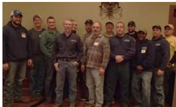
The photo above is of some of the Safety Award winners for 2014. Awards were presented at the Annual Safety Meeting in November. Congrats to all the winners.